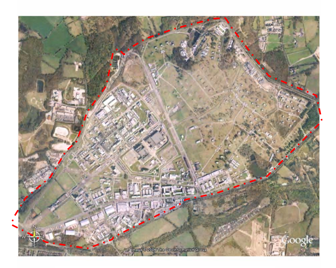
FIGURE 1 AWE ALDERMASTON